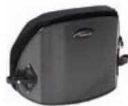
Jet Stream Pro® Back Support System Ultra lightweight back rest