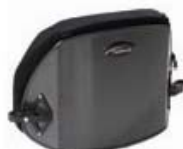
Jet Stream Pro® Back Support System Ultra lightweight back rest