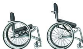
Elevation Ultra lightweight back rest