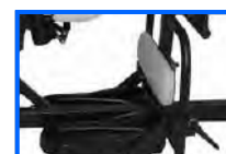
Solid Calf Panel