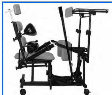
Symmetry shown with optional low back, extended back, hip guides, lateral supports, two piece handle and headrest.