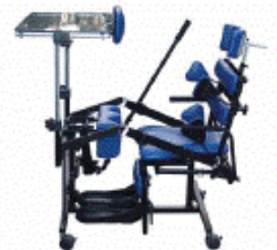
High Back System