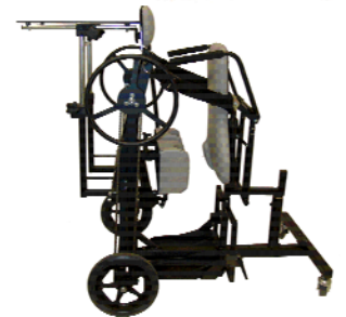
Low Back System

Symmetry ability for the back and seat to maintain proper alignment while standing is unequalled. The design of the 'support system maintains the back in a full-contact supportive position, both while seated and, most importantly, while standing.