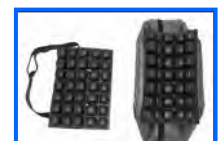
Roho Knee Pads