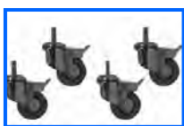
Steel Caster Upgrade